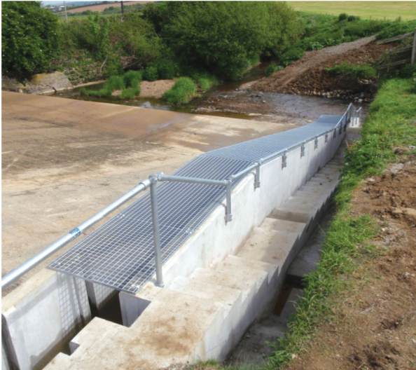
Whalesborough fish pass