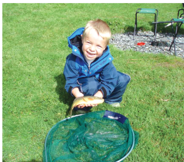
Look what I caught!

Working with the Plymouth based youth group, we enabled 80 children to sample coarse fishing over five days.