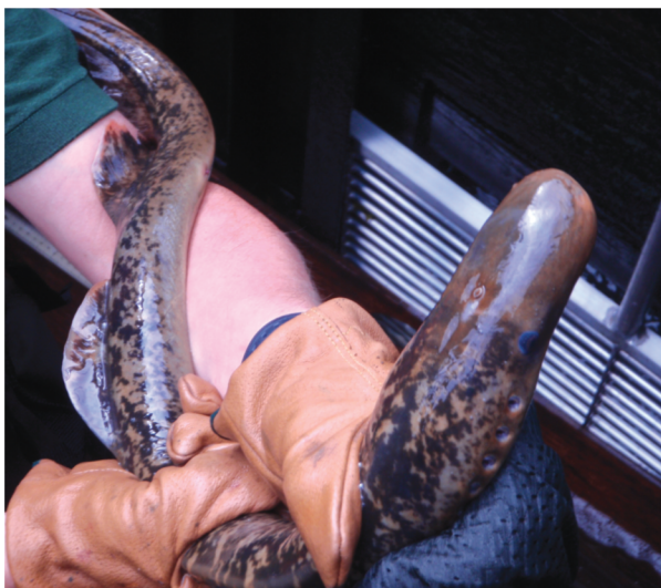
Lamprey caught in Gunnislake trap

Data from the River Tamar trap and fish counter suggest that, although there have been reasonable numbers of multi-sea winter salmon returning, grilse numbers have been unusually low.