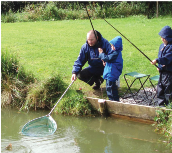
One for the net...

This project was a collaboration with SW Lakes Trust who gave us free use of Stithians. We were able to run five days for pupils from the school. This enabled 80 students a chance to try a days fishing.