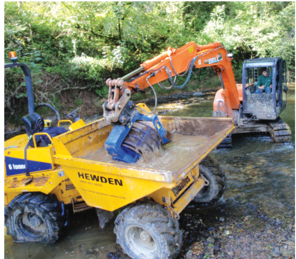
Gravel cleaning at Luffincott

The Fowey River Association are key partners in a project with SWW funding to improve spawning gravels in the Trenant Stream near Park Pit. The work will start in the next few weeks.