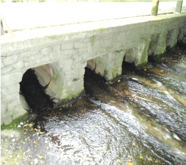
Combebow Pipe Bridge - migration blocker