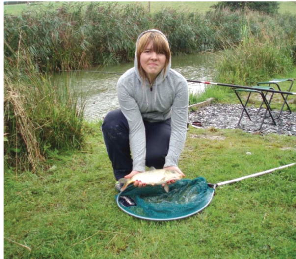
Having fun at one of our angling days

With a free venue provided by SW Lakes Trust, we were able to run five days of fishing using the wheelyboat at Siblyback, coaching 45 people.